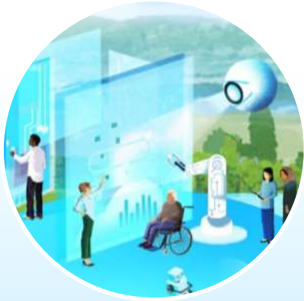
SKILLS ARE THE CURRENCY OF WORK