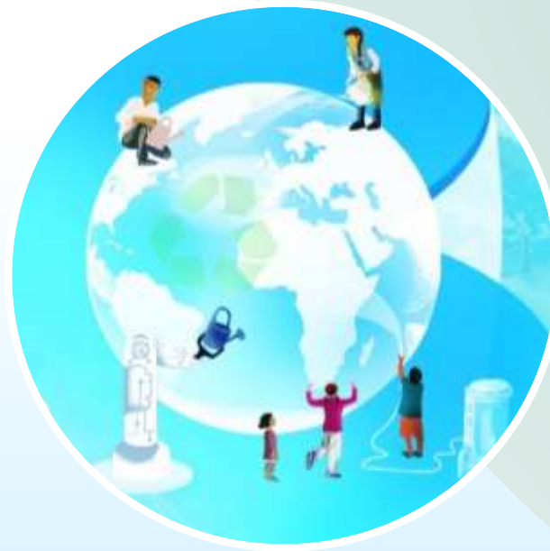
EXPLORING ALTERNATIVE TALENT