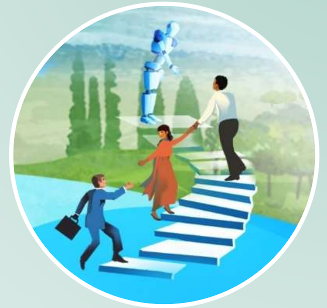
EMPOWERING HUMANS WITH TECHNOLOGY