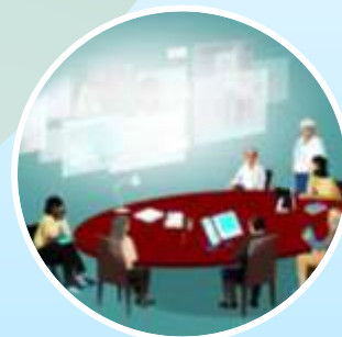
Technology Embedded Into Work