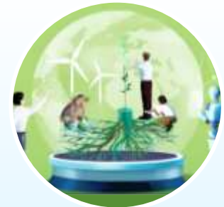
Reduced Carbon Footprints