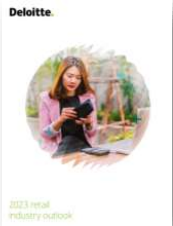
2023 Retail Industry Outlook | Deloitte US