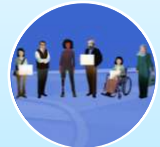
Diversity In Everything We Do